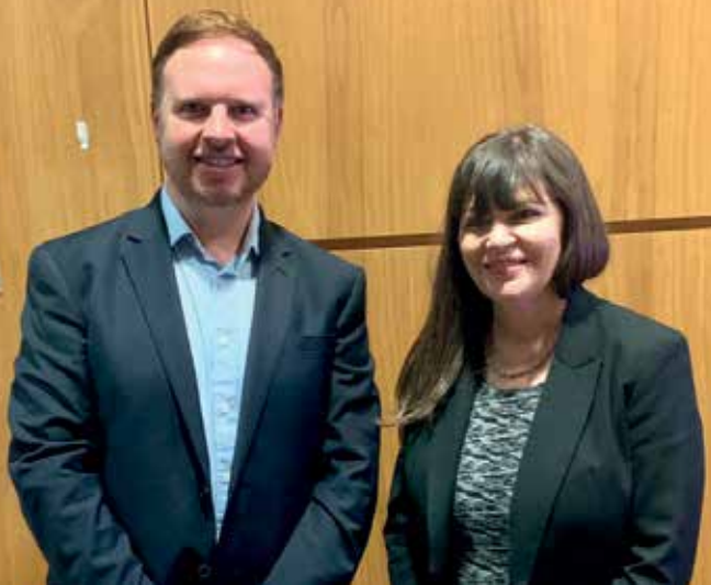
We meet the Minister for Mental Health